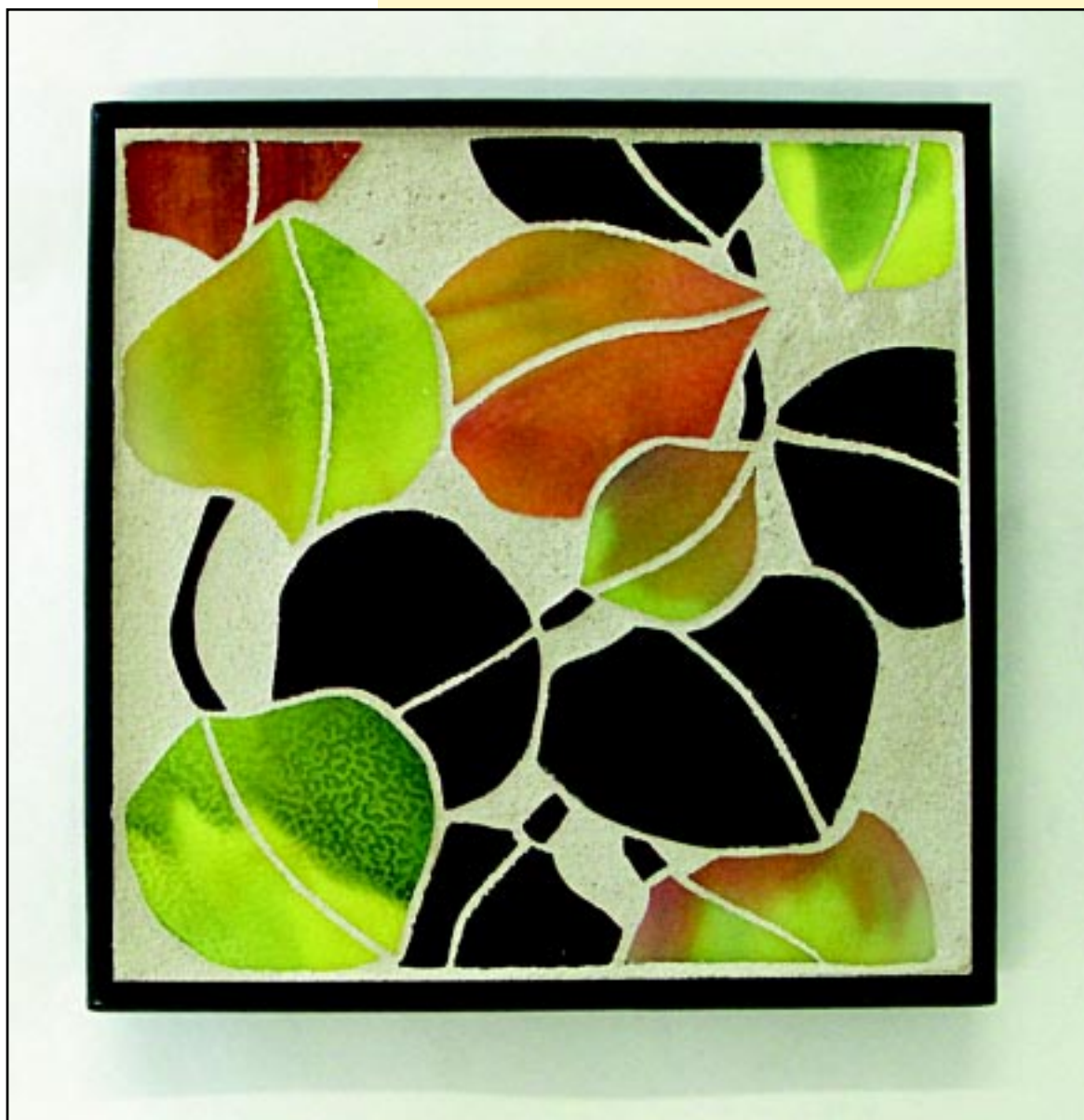
Design, Fabrication, and Text by Lisa Vogt

S avor the gentle rush, the cool crisp bite of the harvest wind, as it announces the arrival of a new season. Welcome fall with this richly colored mosaic tray. This fun project is fast and easy to make. Just follow the step-by-step instructions and our festive treat is yours to enjoy.